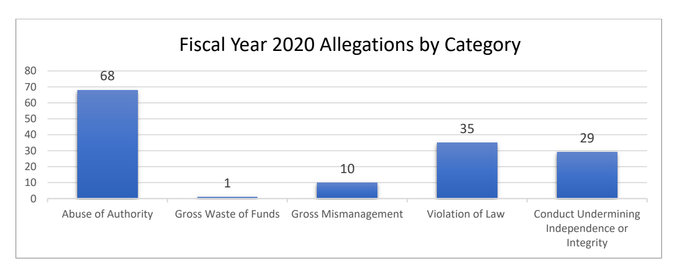
Figure 2. Fiscal Year 2020 Allegations by Category

The IC takes action on allegations of wrongdoing that involve abuse of authority in the exercise of official duties or while acting under color of office; substantial misconduct, such as gross mismanagement, gross waste of funds, or a substantial violation of law, rule, or regulation; or conduct that undermines the independence or integrity reasonably expected of such persons ( see Figure 2). Typically, each case contains multiple allegations of wrongdoing against one or more Covered Persons within an OIG or OSC, averaging over 50 pages of substantive information for IC review per closed case.